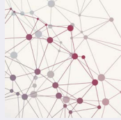
Information Risk Assessment Methodology 2 (IRAM2)