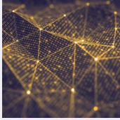
Standard of Good Practice for Information Security 2020

ISF Members have access to a wide range of research, integrated tools and methodologies including: